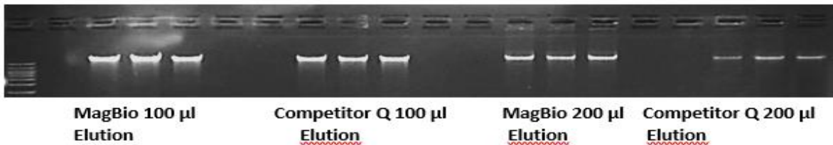
Figure 1. DNA integrity: Genomic DNA was extracted from 200 µl of whole blood using MagBio HighPrep™ Blood-Tissue DNA Kit and Competitor Q Blood & Tissue kit. Following extraction, 10 µl from 100 and 200 µl eluates of purified genomic DNA was analyzed by gel electrophoresis on a 1% agarose gel. Figure 1 shows that genomic DNA recovered by both kits was intact; there was no DNA degradation.

MagBio's HighPrep™ Blood-Tissue DNA Kit is a high-quality genomic DNA isolation and purification kit for a variety of sample sources including fresh or frozen whole blood, buffy coat, saliva, fresh or frozen animal tissues and cells. Comparison of this kit with one of the well known commercially available kit (Competitor Q Blood & Tissue kit) shows MagBio's HighPrep™ Blood-Tissue DNA Kit superiority in DNA recovery from blood.